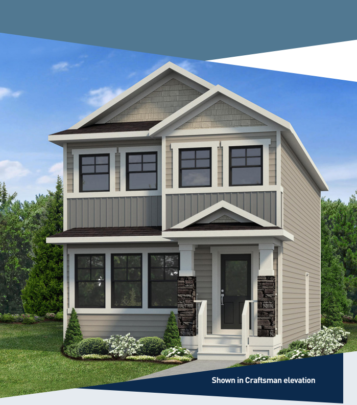
Shown in Craftsman elevation