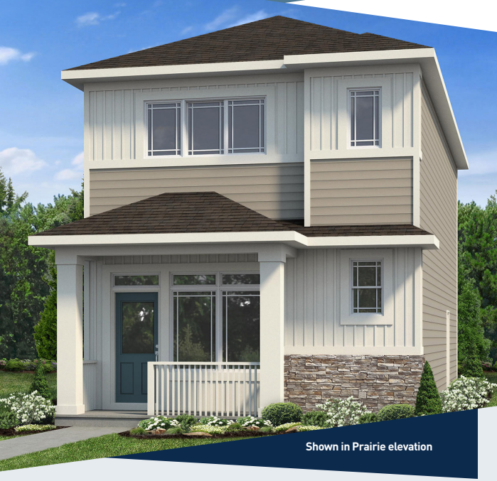
Shown in Prairie elevation