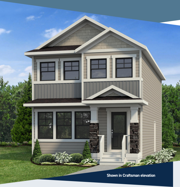
Shown in Craftsman elevation