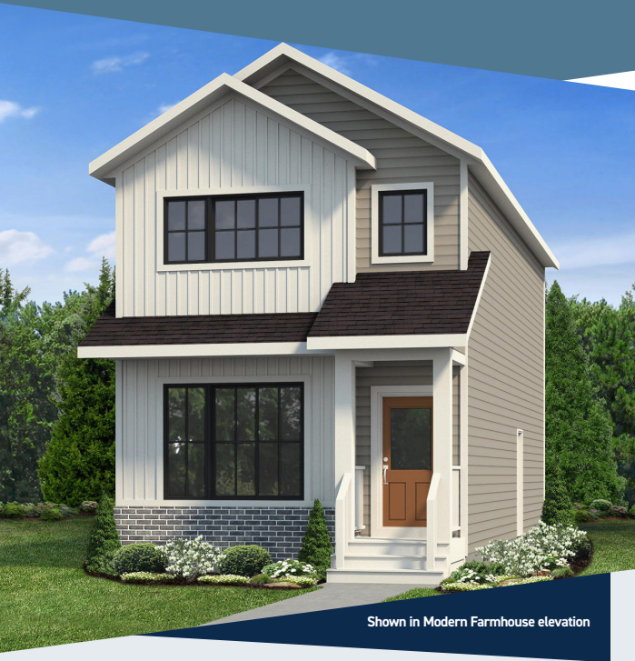
Shown in Modern Farmhouse elevation