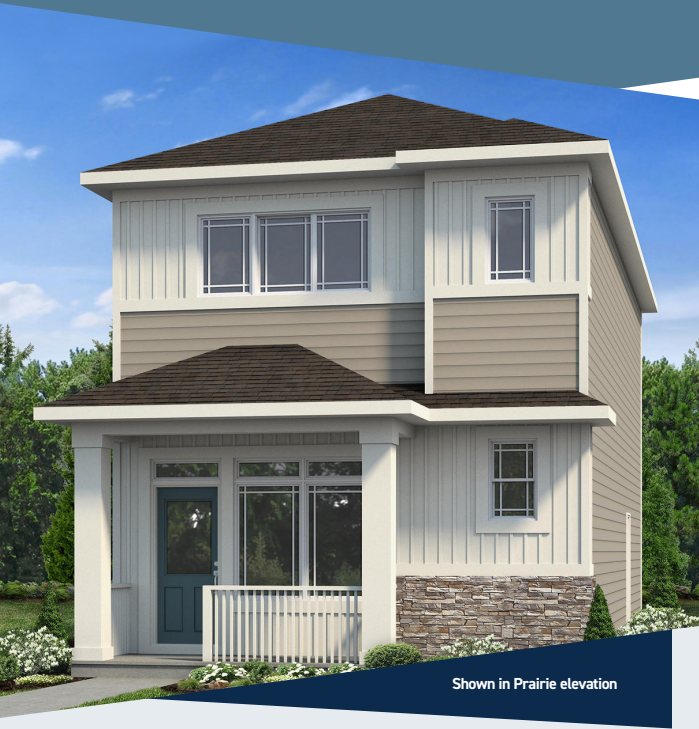
Shown in Prairie elevation